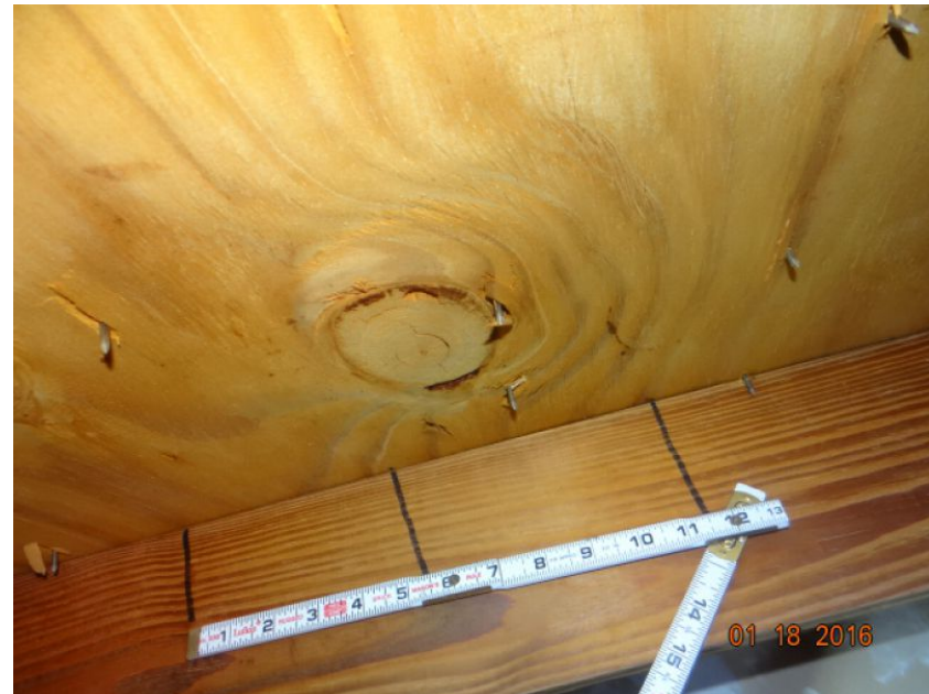
8d Nails or Greater in Size Spaced 6" Along the Edge