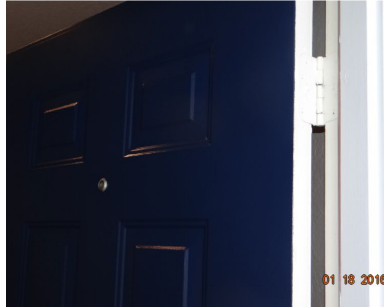
Unprotected Solid Entry Door