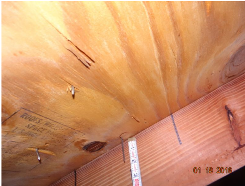
8d Nails or Greater in Size