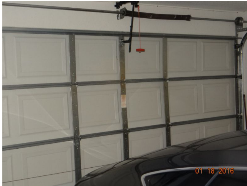
Unprotected Solid Garage Door