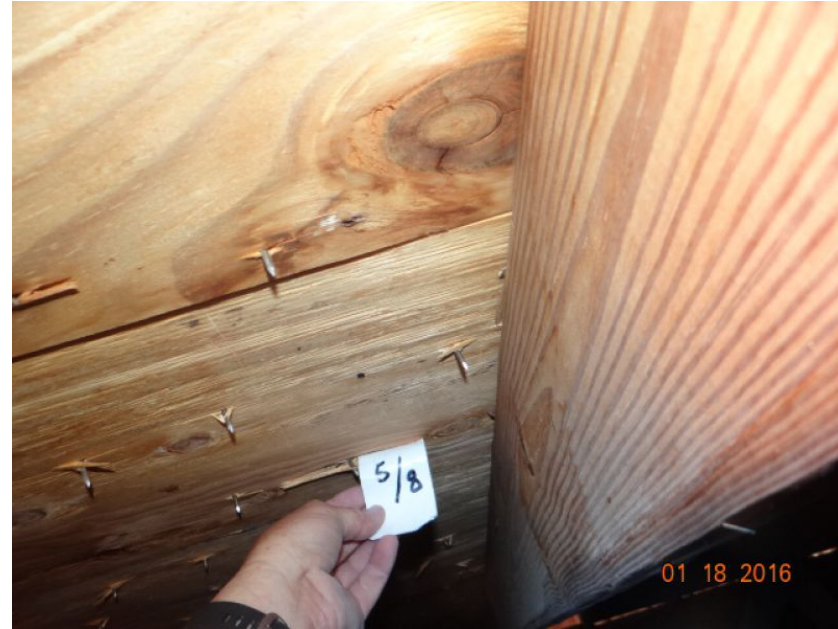
5/8" Deck Thickness Confirmed