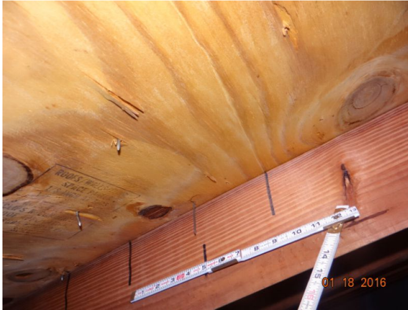
8d Nails or Greater in Size Spaced 6" in the Field