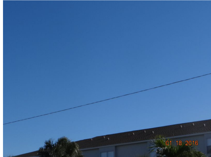
Asphalt/Fiberglass Shingle Roof Covering