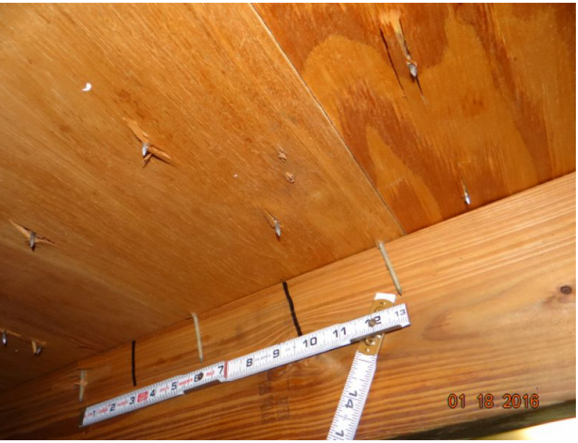
8d Nails or Greater in Size Spaced 6" Along the Edge