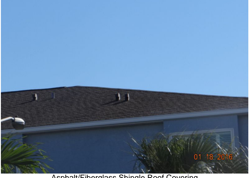
Asphalt/Fiberglass Shingle Roof Covering