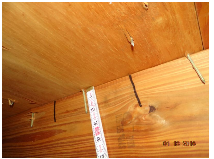
8d Nails or Greater in Size